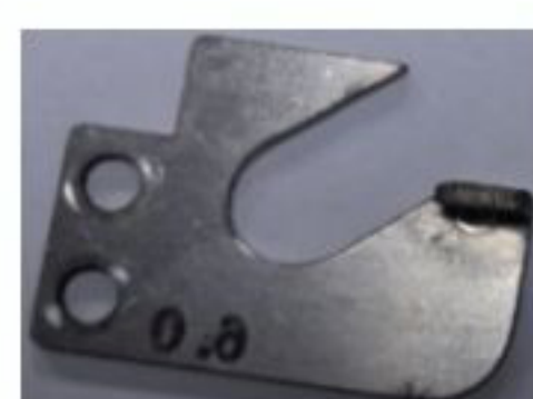
E-5003 Terminal Blank Board $10/pc