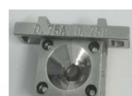
E-0600 2.5 Copper Core Guide $40/pc