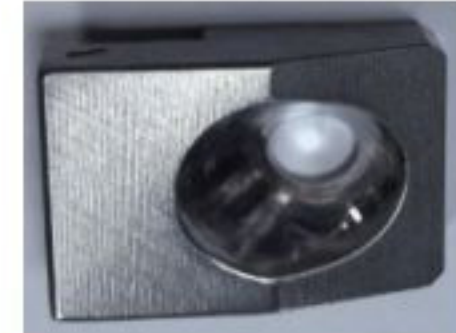
E-1346 Pay-off Guide Block $20/pc