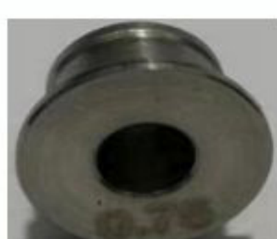
E-0601 2.5 Square Terminal Guide $10/pc