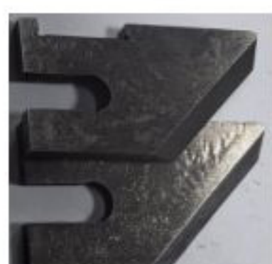
E-0456 Stripping Knife $20/set