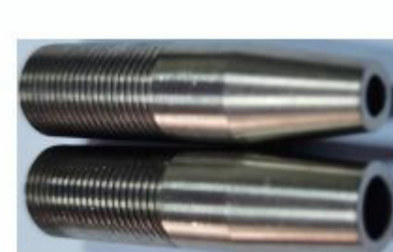
E-1344 Terminal Blanking Pipe $10/pc