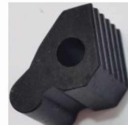
E-1345 Four Side Pressing Block $20/pc